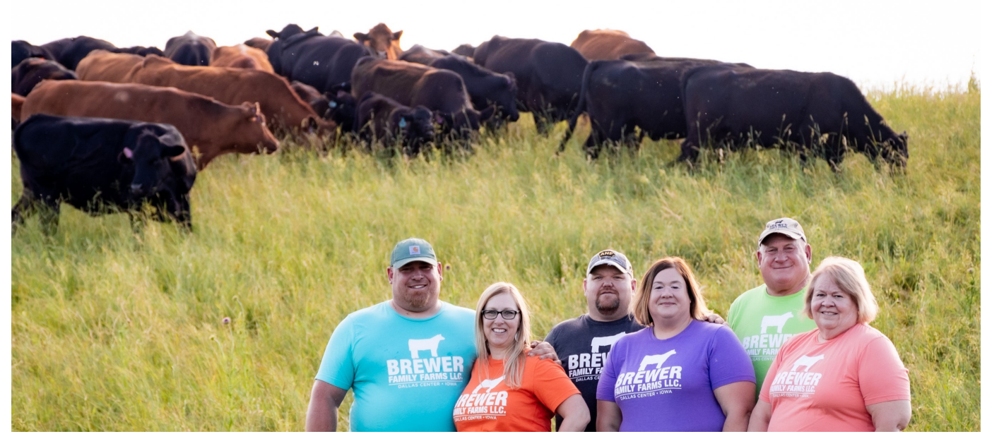
Family is at the core of Brewer Family Farms. The whole family is involved in the farm operations and are the fifth generation to own and operate the farm.