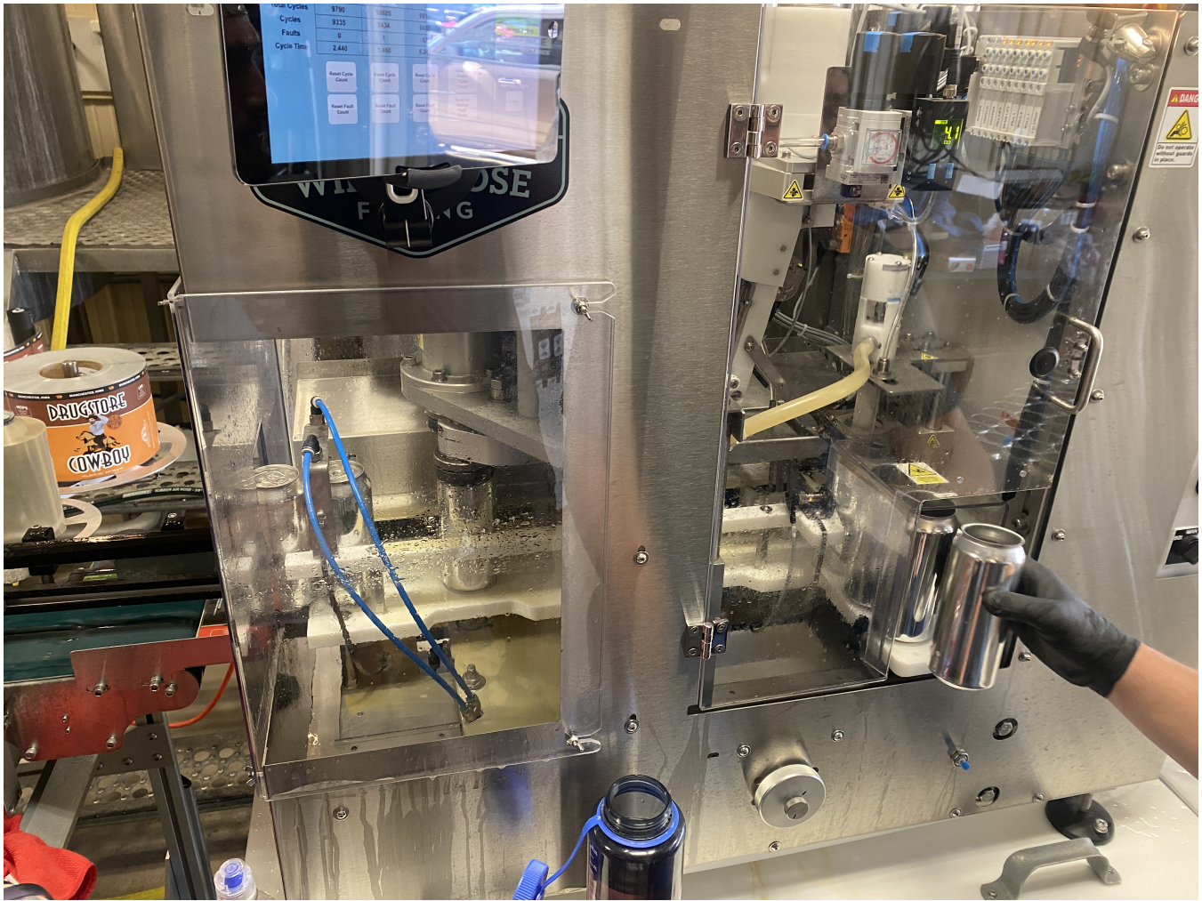
The new canning machine purchased by Choose Iowa grant funds is installed and in production.