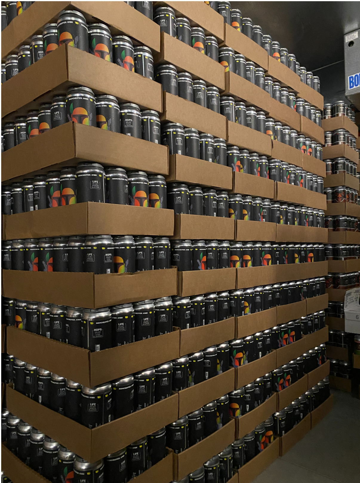
Stacks of the new cans produced by the new canning line purchased with Choose Iowa grant funds.