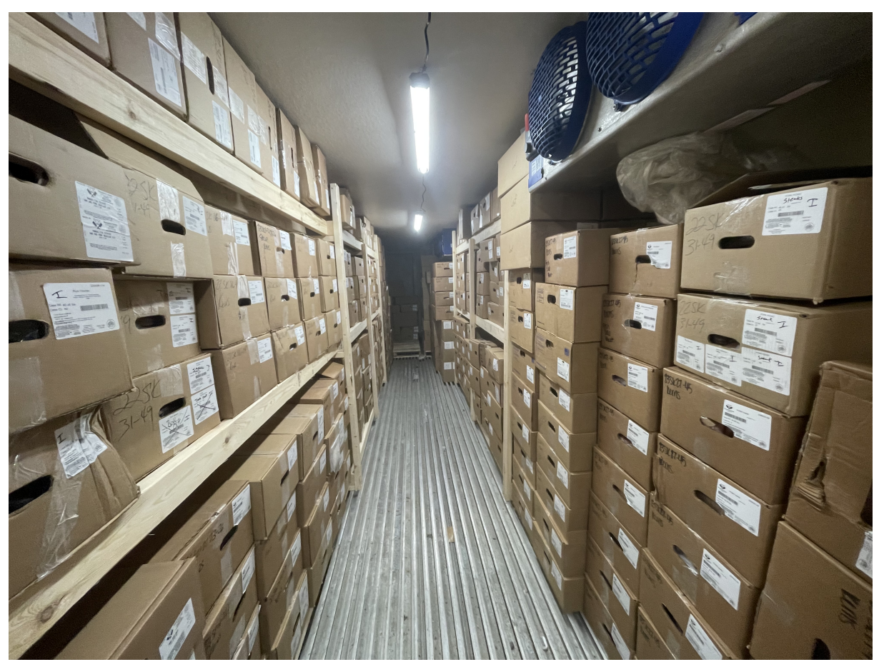
New freezer purchased with Choose Iowa grant funds.